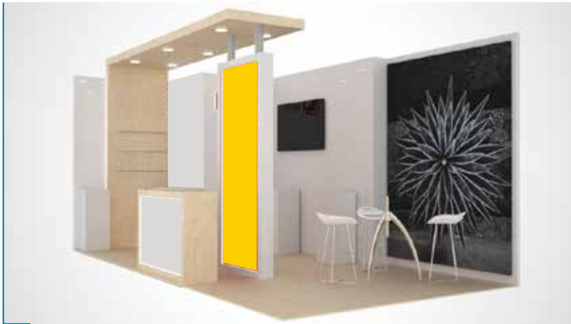
Custom Exhibition Stand